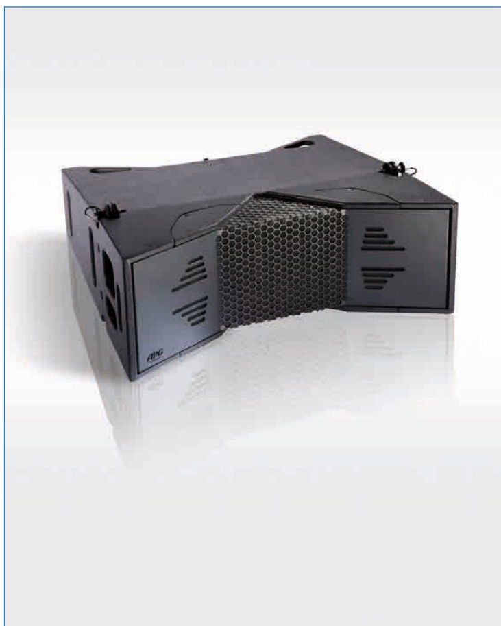
UL210 Line Array Speaker

The UNILINE is a highly modular line array system composed of 3 speakers: UL210, UL210D, UL115B. Thanks to an unlimited acoustic and mechanical modularity it is adapted to a very large field of applications from medium to very high power. The APG Uniline UL210 main "line array" element is designed for medium to long-range sound reinforcement applications requiring high power, maximum clarity and exceptional pattern control. The UL210's Neodymium Mid/Hi speakers, yield unrivalled, high fidelity output. 85° horizontal coverage is constant across the whole frequency range. The ISOTOP10™, vertical 10° iso-phase waveguide produces exceptionally precise, uniform acoustic coverage. Rugged, ergonomic rigging hardware provides especially secure system focus. Fast, accurate inter-enclosure angle adjustment are available in one-degree steps, between of 0° to 10°.